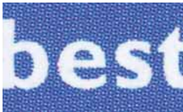
Without HP Adaptive Half-toning