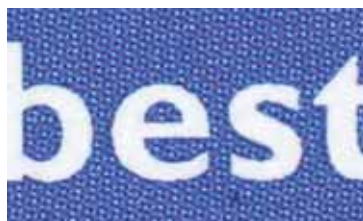
With HP Adaptive Half-toning