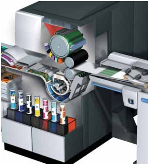
HP Indigo presses offer a 5, 6 or 7-color capability – available as an option for a 4-color press through an affordable upgrade.

An HP Indigo press is embedded with a 5, 6 or 7-color capability, letting you tap into the opportunities afforded by HP IndiChrome. Plus, it's available as an option for a 4-color press through a quick, affordable upgrade that won't disrupt your operation. Changing or adding inks to the press is simple and straightforward to maximize press uptime.